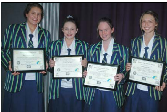
Congratulations to the Year 10 Debating Team who were victorious against Calvary Christian College in the final round of the Rotary Debating Competition.