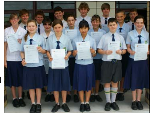
Congratulations on receiving a Distinction in the Australian School English Competition.